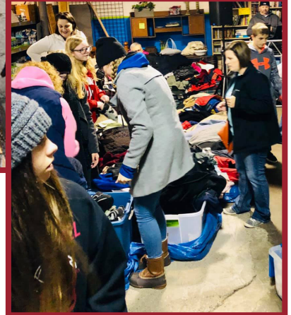
Above Left: Attendees line up outside the ReStore to receive blankets, jackets, socks, and a warm meal. Above: Donations and attendees fill the ReStore for our community event.